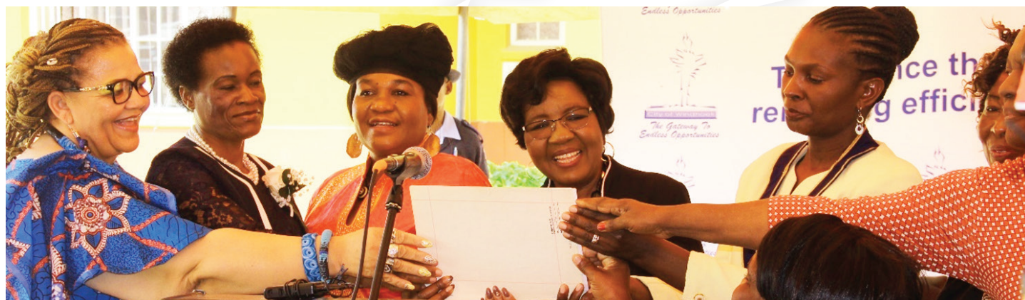
Hon Sophia Shaningwa Minister of Urban and Rural development handing over title deeds documents to Deputy mayor of the City of Windhoek Cllr Fransina Kahungu flanked by Hon Margaret Mensah-Williams, Hon Rachel Jacobs, Governor Laura McLeod-Katjirua, Cllr Hileni Ulumbu and along with rest of City of Windhoek Councillor.

The City of Windhoek has as from Friday, 8 September 2017 officially received the responsibility to manage the supply of municipal services to Groot-Aub. Hon Sophia Shaningwa handed over the title deeds documents to the City of Windhoek that was received on behalf of the City Council leadership by Deputy Mayor Fransina Kahungu. Hon Shaningwa at the same occasion lifted the moratorium that was in place to stop the sale of Groot-Aub land, and that the responsibility for land sales now lies with the City of Windhoek.