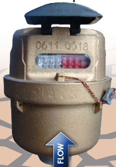
Water supply from City of Windhoek

To Consumer: Maintenance of pipes after meter is Customer's Responsibility